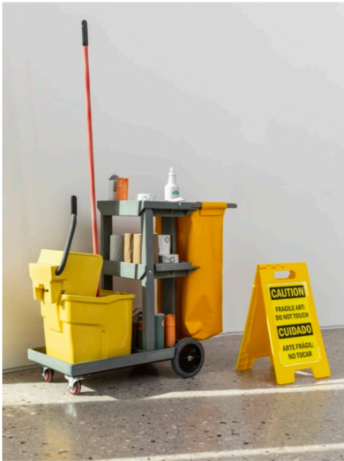
Michelle Grabner, Untitled (Janitorial Cart) (2024-25)

Spring Studios, 50 Varick Street, Tribeca, Manhattan