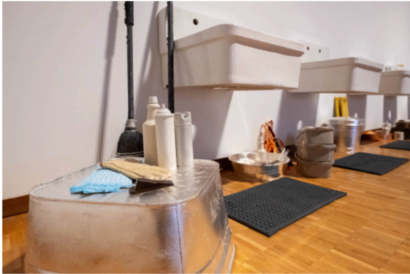
Michelle Grabner, "Untitled (Janitorial Closet), 2024 (image courtesy of the artist and Haggerty Museum of Art)

The early-blooming daffodils may bow their trumpets in defeat amid the frosty trickery following Fool's Spring, but no amount of rain and dreary weather can thwart the annual blossoming of New York City's spring art fair season. Over the next few weeks, over a dozen art fairs will simultaneously sprout across NYC, each consisting of their own ecosystem of thematic presentations and desired audiences.